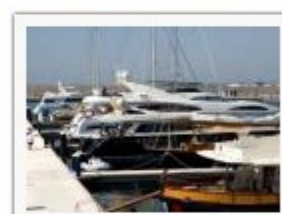
Ports & Marina's